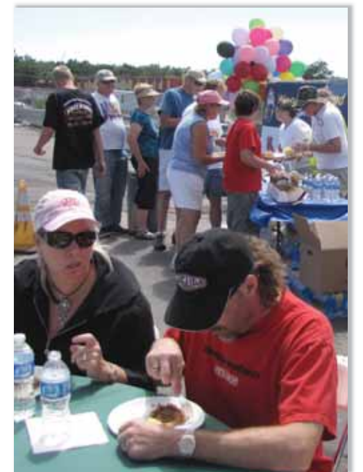
Attendees enjoying the August BBQ