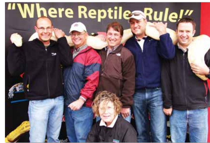
Members of the project team holding a python from Scales and Tails at the June BBQ

On the north side of Woodmen Road, east of Academy Boulevard, a mountain of dirt grew. The dirt was excavated material from around the project area, and it was stored in the construction yard. Stories came to the project team's attention that this was where the bridge would be built. Not so! As the project progresses, the dirt is being used to backfill retaining and noise walls and is gradually disappearing. Soon, the mountain will be gone and replaced with a storm water detention pond.