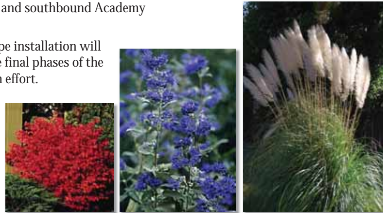
Left to right: dwarf burning bush, blue mist spirea and pampas grass

Mulch, cobblestones and other trimmings will give the landscape a nice level of finish. The landscape will have lower water requirements and, as with all landscapes, will require some maintenance. The plantings along the corridor and around the new interchange will add continuity, order and beauty for the enjoyment of residents, businesses and the traveling public for many years to come.