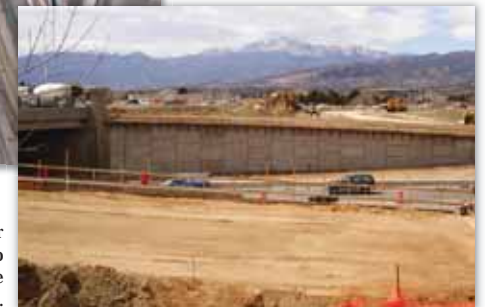
Above - most recent aerial view of the new Woodmen Road Bridge At right - view of the construction of the new northbound Academy Boulevard ramp

All major traffic shifts for the project have been completed. There will be some minor traffic shifts needed to complete various items of work such as paving. Academy Boulevard has returned to 3-lanes each direction.