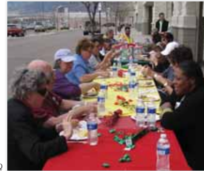
Folks enjoying the BBQ.

The eighth project BBQ was held at the Woodmen Commons Shopping Center (Sam's Club) on May 6th. Approximately 250 folks came to enjoy the Rudy's BBQ pulled pork. The project team appreciates the volunteers from the local communities of Falcon, Yorkshire, and Brookwood Estates. The Woodmen Enhancement Committee was also there to welcome everyone to the free BBQ.