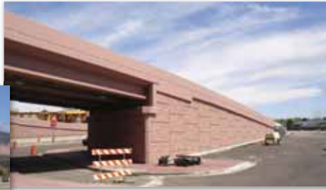
Above - New staining on walls of the southbound exit to Academy Boulevard. Left - Aesthetic and landscaping details at the top of the Woodmen Road Bridge Below - View of the northbound ramp to Academy Boulevard

The bus stop along westbound Woodmen Road near the "Hobby Lobby" entrance will open in the near future. The bike lanes along Woodmen will be opened in July/August when the final layer of asphalt is completed.