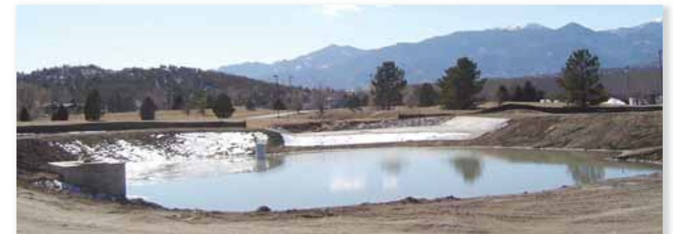
Draining the existing 42-inch water line

locations; installing a series of valves; and, finally, recharging the line. All phases went smoothly. The recharging was completed ahead of schedule.