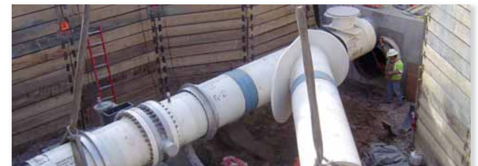
Installing a series of valves