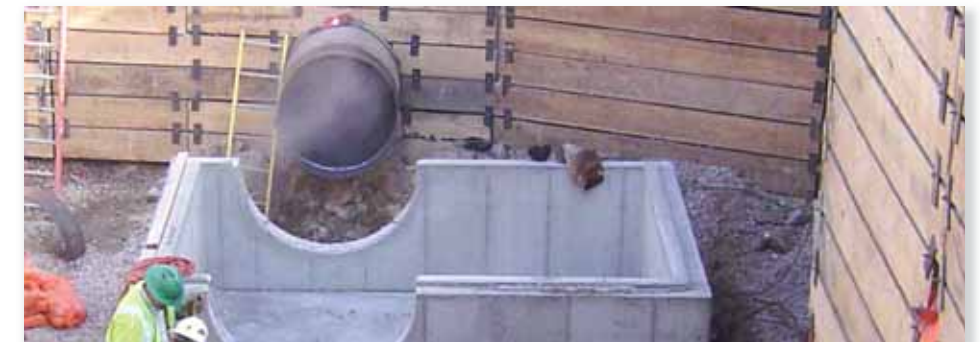
Removing a section of the existing water line at two locations