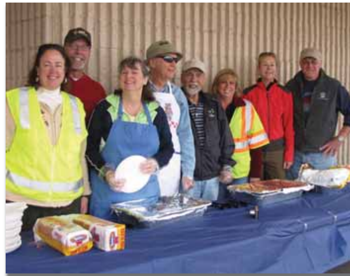
Hard working volunteers from the project team and Yorkshire, Falcon, Brookwood Estates and WEC.

Approximately 250 folks turned out for the BBQ. Hosts were there from Yorkshire Estates, Brookwood Estates and Falcon/Columbine Estates. The Woodmen Enhancement Committee was also there to welcome everyone to the free BBQ.